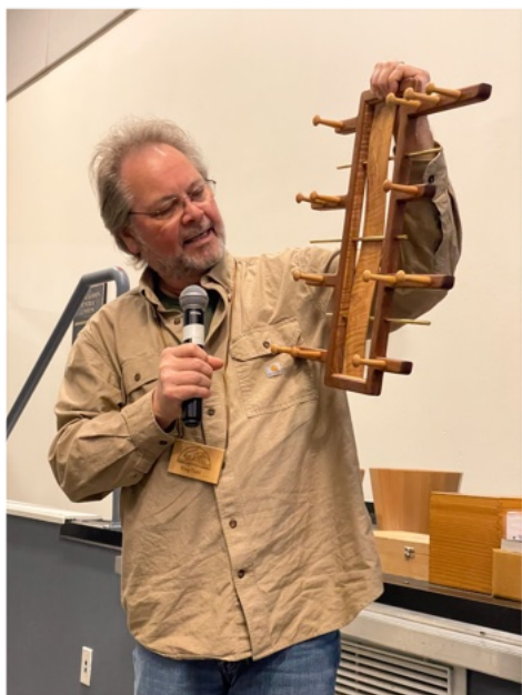
King Dahl – Sapele and maple necklace and earring holder, finished with Livos