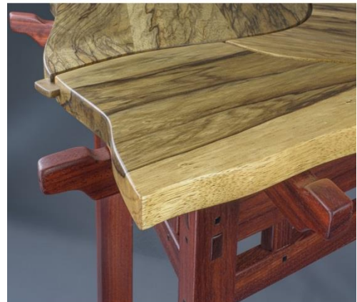
Darrell Peart Tercet Table