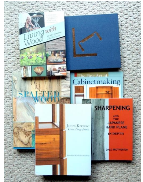
New Library Books