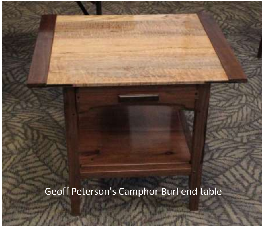
Geoff Peterson's Camphor Burl end table