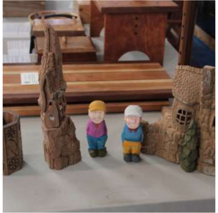
Love these little guys!