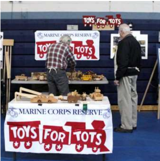
So many toys!