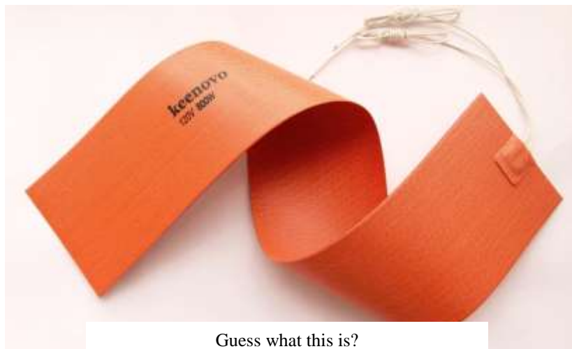
Guess what this is?

With no further business, the meeting was adjourned at 8:30 p.m.