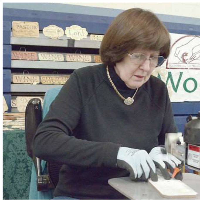
Hard at work!