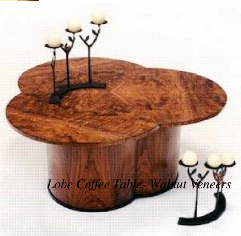
Lobe Coffee Table- Walnut Veneers