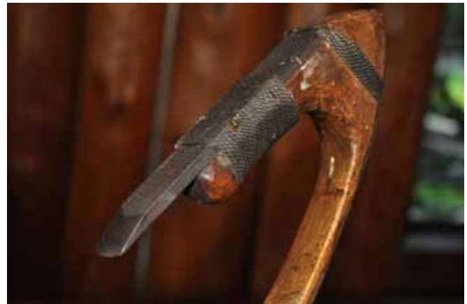
Adz made from an old file

He likes window shutters and uses them as sides for a chest, for example, or as chair-backs. An unassuming man with a storyteller’s charm, Eicker brought his tools and a lot of recycled items to illustrate what can be done with unlikely materials.