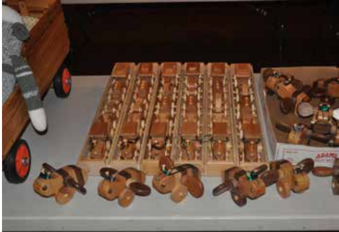
Santa's helpers were very busy, in deed....