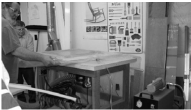
A demonstration of vacuum bag veneering.