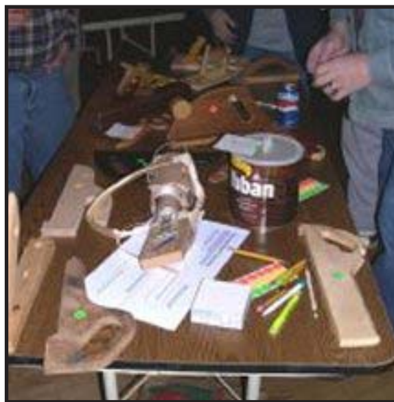
Push Sticks galore.....from the simple to elaborate to cute. A fun project for all who participated!