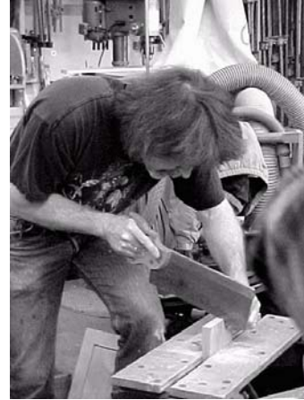
Right: Sawing pins and tails.