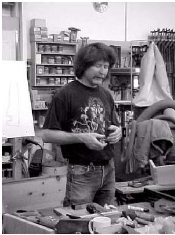
Left: I can cut 'em with my eyes shut!