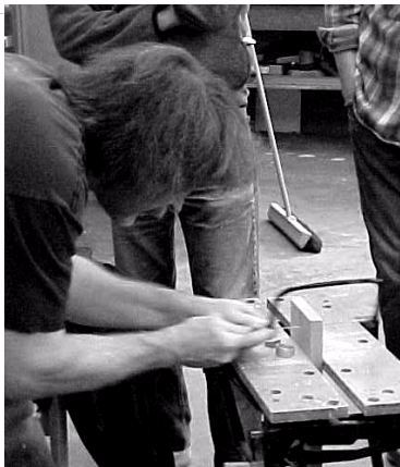
Left: Removing waste with coping saw.