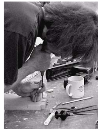
Right: Fine tuning by paring with a chisel.