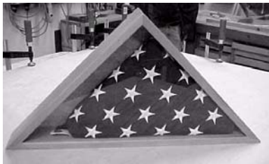
A finished flag box, ready for shipping