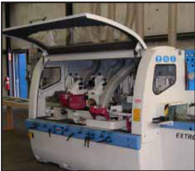
A SIX headed molder! Quite a monster indeed. It takes a while to get it set up, but once it is it makes all imaginable shapes in one pass. It's brand new and not yet run.