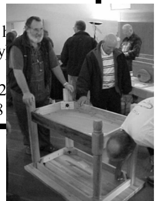
The Parts going together