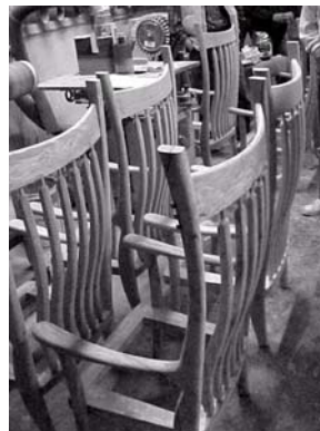
A group of recently glued up chairs waiting to be finished.