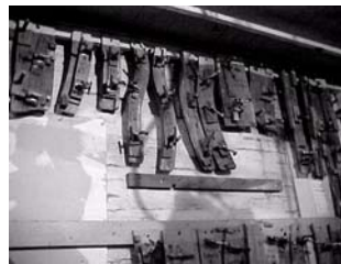
Left: Some of the many jigs used to shape profiles for various chair parts. Right: A two headed profile shaper.

In the past, we have published a formal membership list that has turned out to be a bit expensive to maintain. Since most members now have email, in the future, we will email the list every quarter and will note on the list which folks are new. We will continue to list vendors. The first list will be emailed in April. It will be snail-mailed to folks that do not have email. If you do not receive the list, please let me know. Also, please check your address, phone, etc. to make sure I have current data.