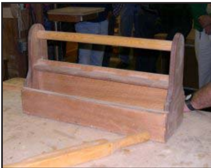
First projects built by all students at Home Port; a tool tote which they will use during their time at the school and then an oar built by traditional method.

Several boats have been built by the students. The