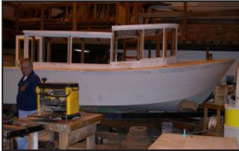
Home Port's latest boatbuilding project.....an Alaskan Skiff which will be used for student field trips and other learning experiences. The school is currently looking for funding of the purchase of an outboard motor to power the boat.

Home Port has experienced an impressive level of success with their students. For most of these students it is the first time in their lives that they have achieved any level of success.....and received any acknowledgement of that success. Home Port is one of the few schools in the Northwest who continue to teach woodworking skills....not as an elective, but as a prime ingredient of their formula for success. Our board has begun the exploration of ways in which NCWA might share our skills and resources with Home Port Learning Center and we will be having further discussions in the near future. –Rick Anderson