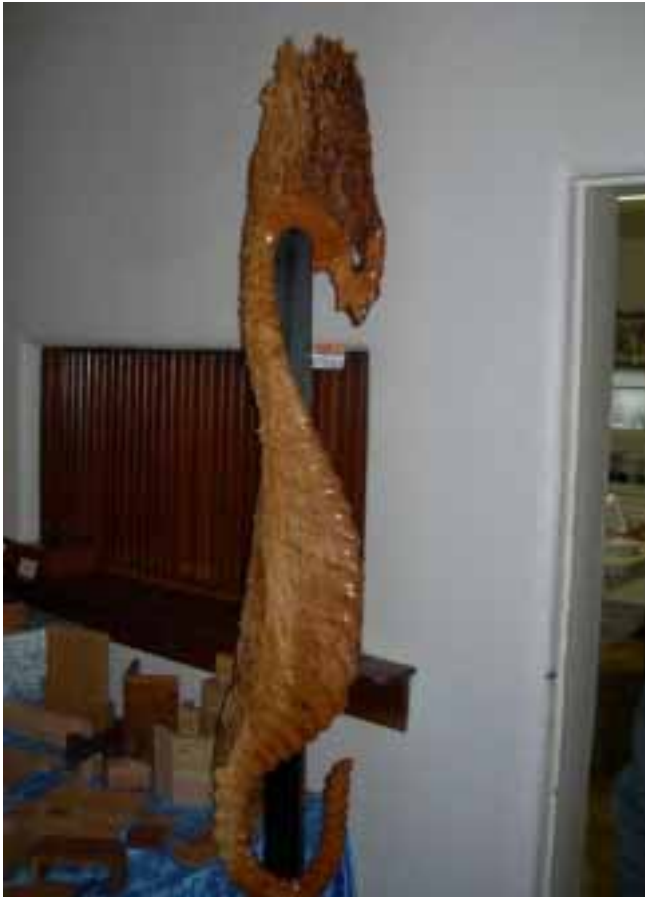
“Seahorse” Sculpture by Andy Swanson

the kitchen. To compliment Andy's work, our members displayed furniture: several tables, a desk, a modern-age stool, a large cabinet-in-process, and much more.