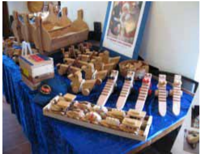
Just a smidgen of the Toys for Tots inventory