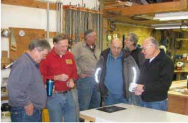
Da Boys -- The plot thickens