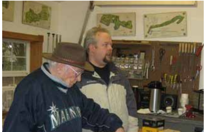
How can I get my hands on that coffee