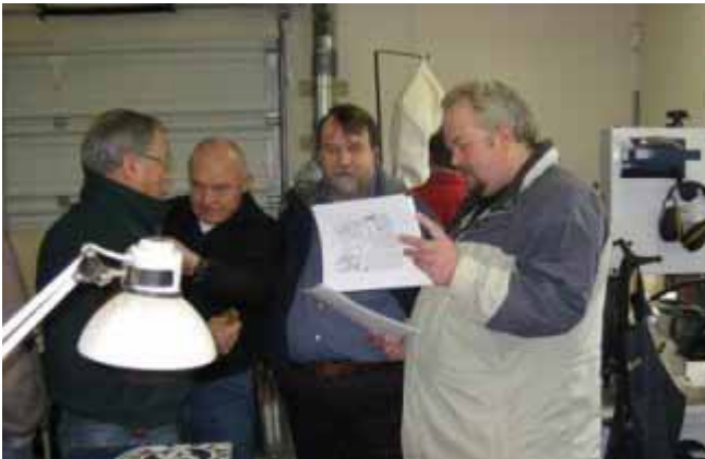
You're sending this to Congress? Who's that nice lady below?