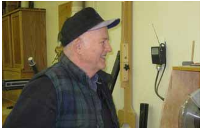
Nothin' like a couple of old buzzards!