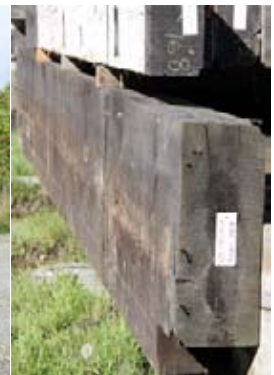
A beam over 2' high and 20' long.