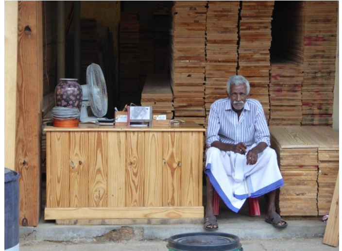
Wood store in Kochi, India