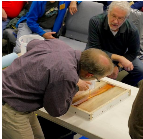
Stormo Presentation at last meeting