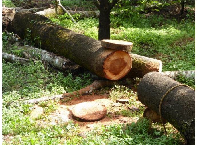
Newly fallen 100 year old Balsa tree in India