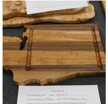
And more boards!