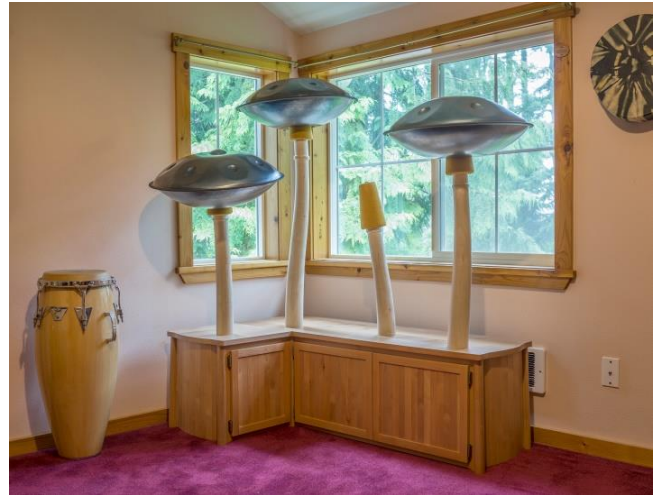
Kevin Reiswig Table