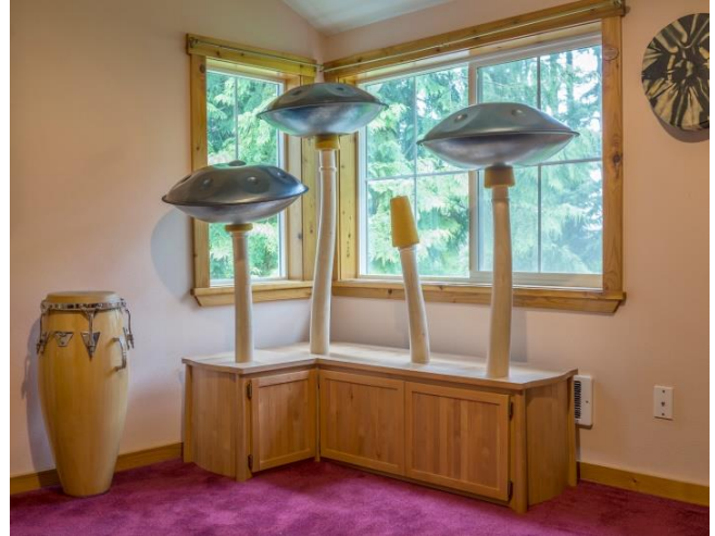
Kevin Reiswig Table