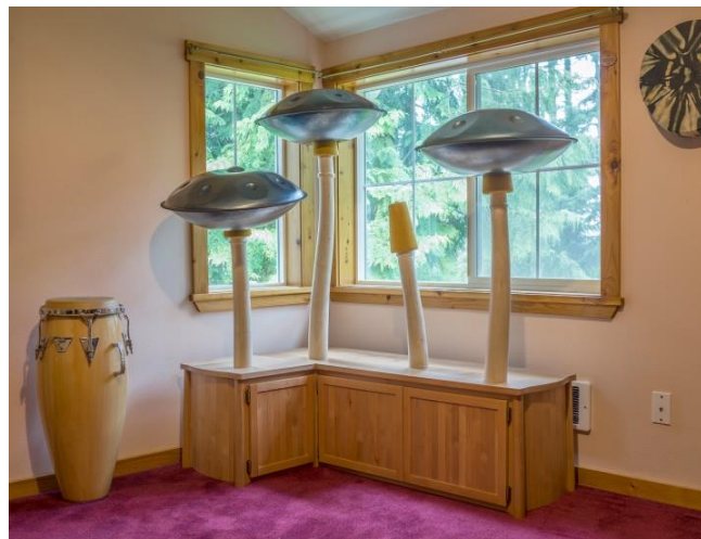
Kevin Reiswig Table