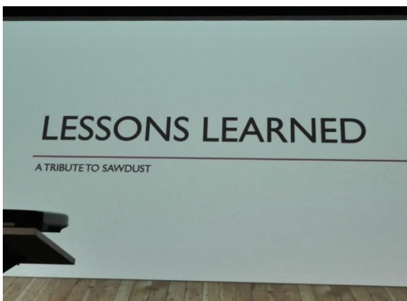
January meeting program