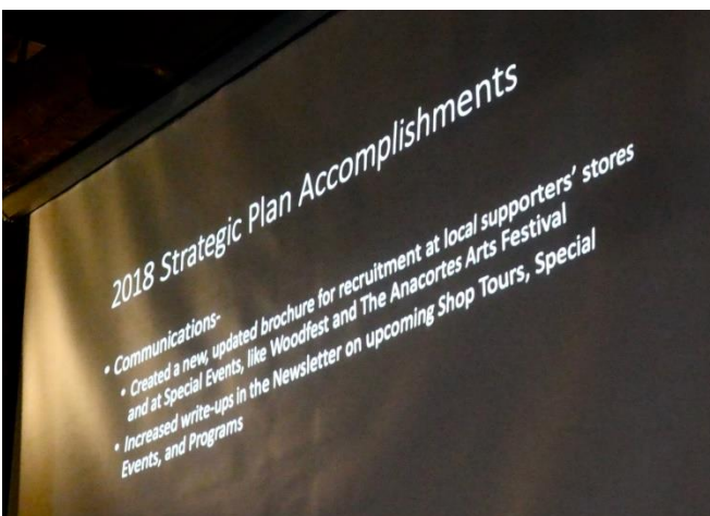
December meeting program