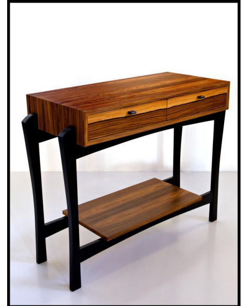
Grady Matthews Table