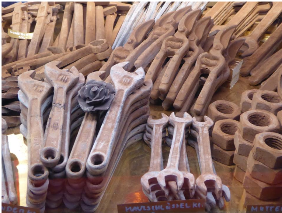
Tools are made of chocolate in Switzerland