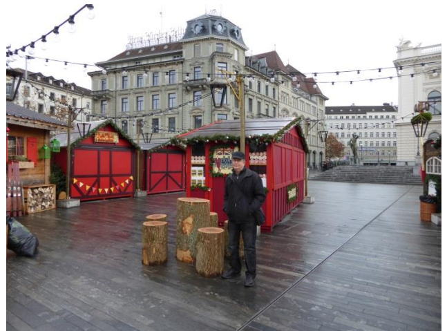
Zurich Special Wood Stock

Take I-5 to Exit 226 (Kincaid Street Exit). Go East up the hill. This is Broad Street. Continue on Broad to South 13th Street. Turn right onto South 13th Street and go about 6 blocks. The park is on your right. Turn into the park. The parking lot is in front of the lodge.