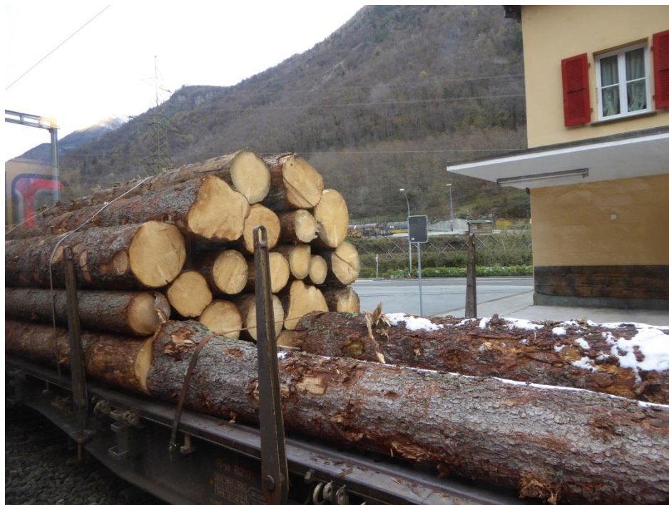
Logging on Bernina Pass