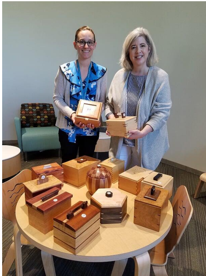
Reception of the Beads of Courage boxes