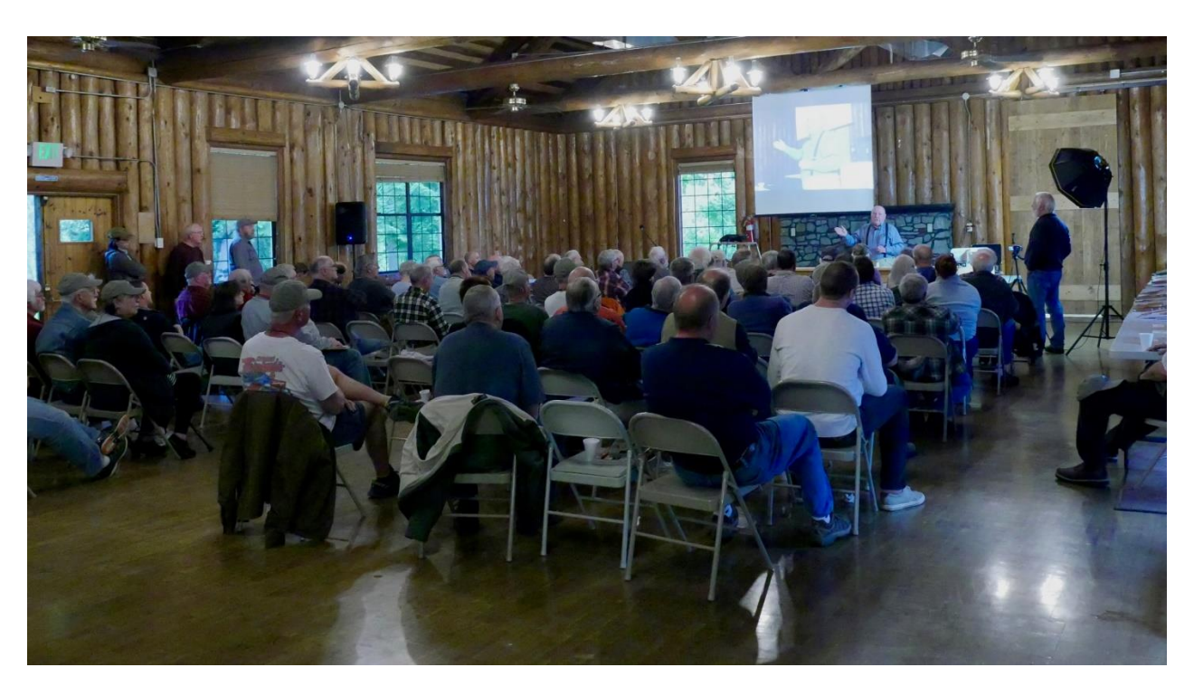
Full House at May Meeting