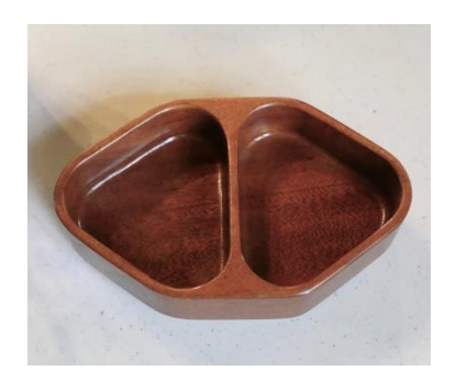
Beautiful Bring and Brag items were proudly shared at the May NCWA meeting.