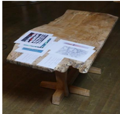
Bring and Brag Table