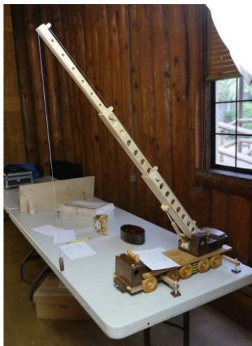
Wonderful fire engine toy

Beautiful Bring and Brag items were proudly shared at the May NCWA meeting.