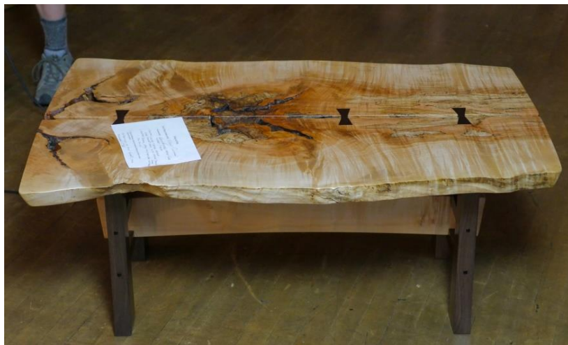
Beautiful custom table