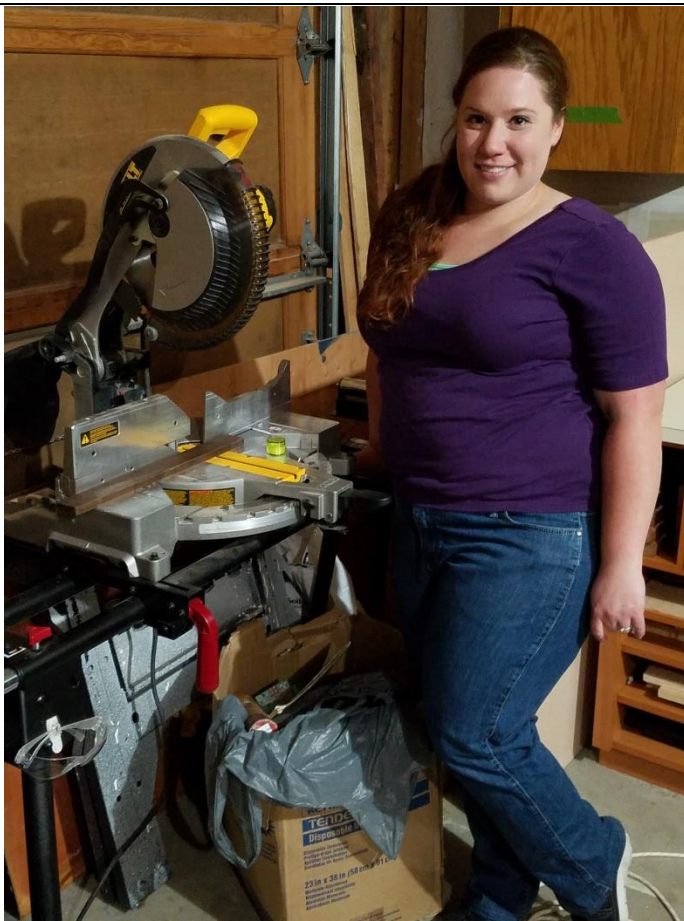
Submitted by Jim Bucknell