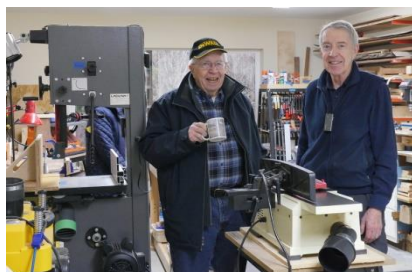
Shop Tour in Bellingham