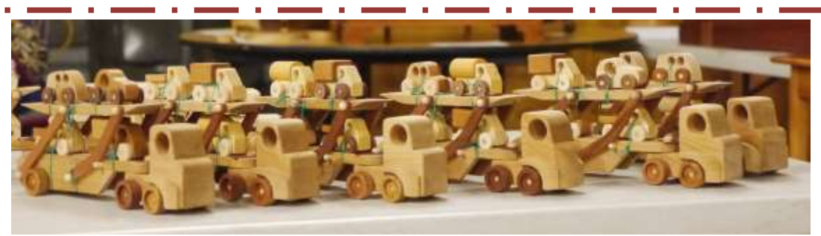
Over 100 wooden toys, and 350 little wooden cars!