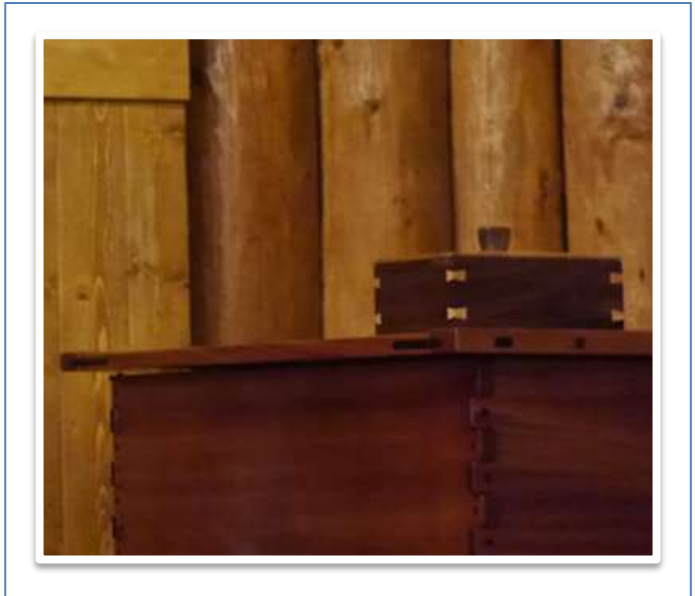
Tom Thornton's walnut box with maple dovetail keys