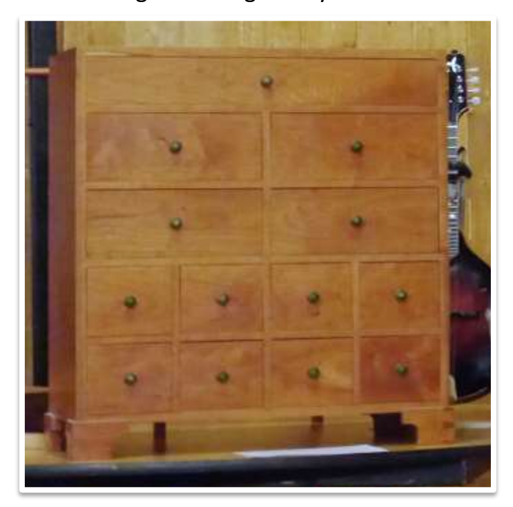
Jim Redding's amazing cherry cabinet