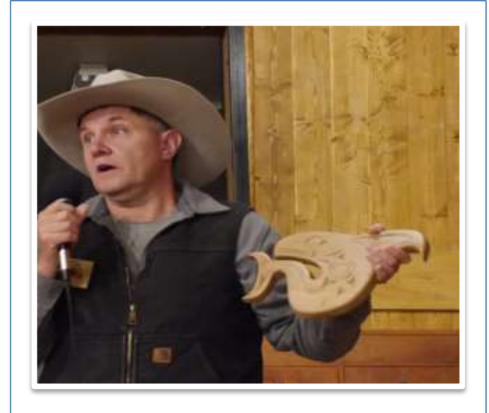
The alder orca carved by Bill Pierce