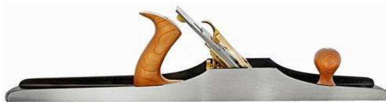
Lie-Nielsen No. 8 Jointer Plane

If anyone has ideas on what they would like to see as a raffle item please e-mail me at jhhickey@gmail.com