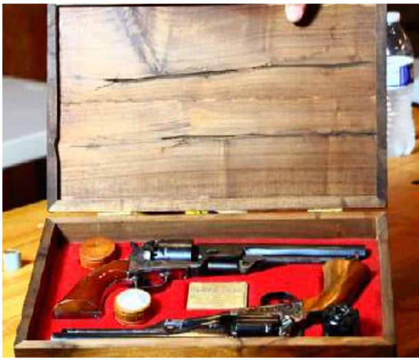
Civil War vintage revolvers WOW!