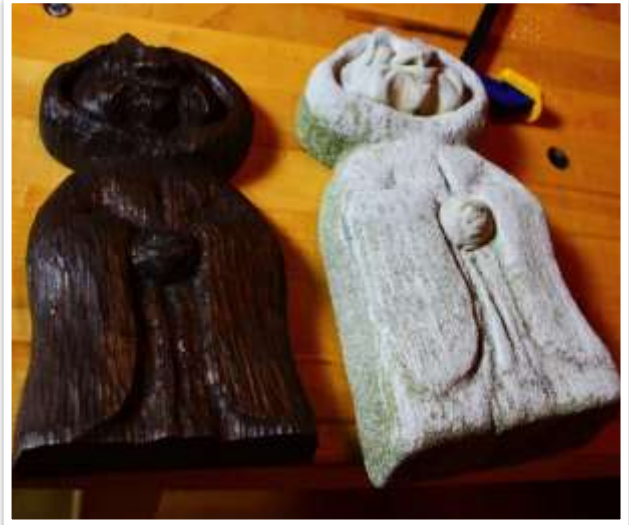
Duplicator Monk in Maple