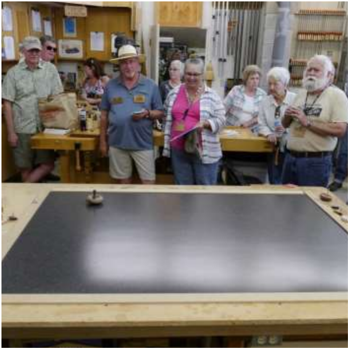
This top just keeps on spinning