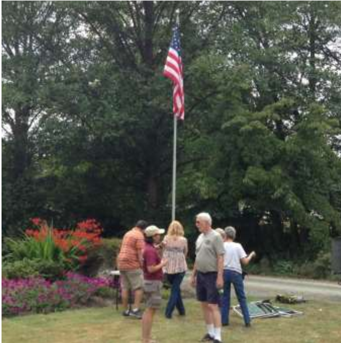
Raising the flag