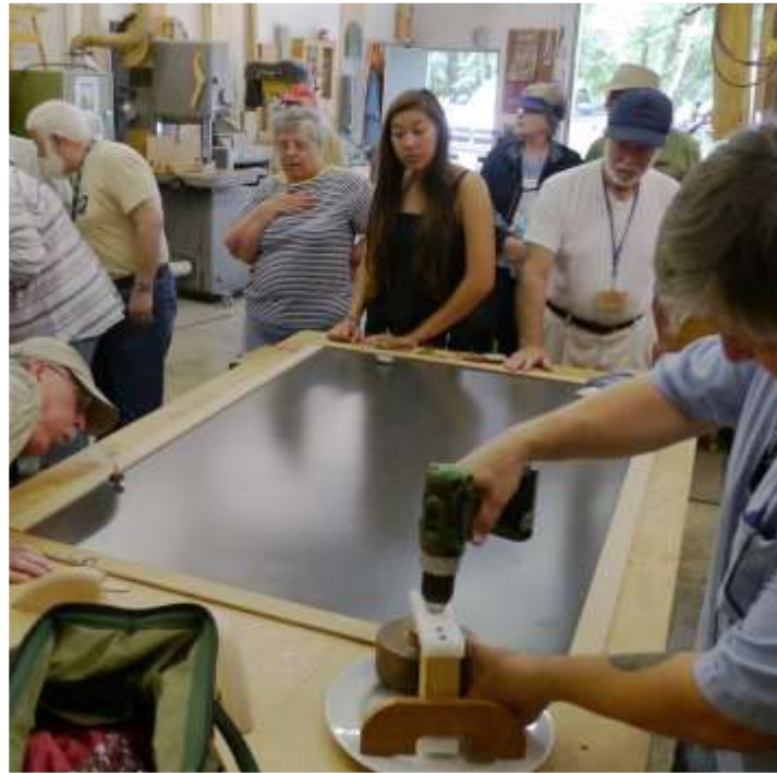
Strong air currents keep it spinning