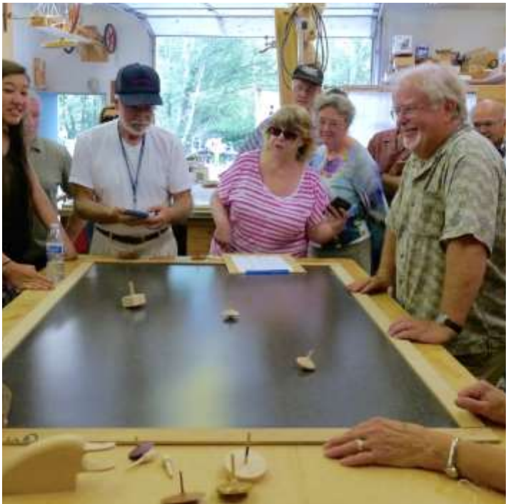
I'm sure that my top is going to win