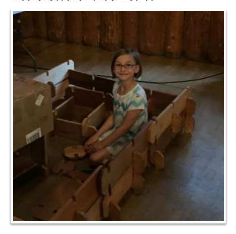
Kids love Jack's Builder Boards