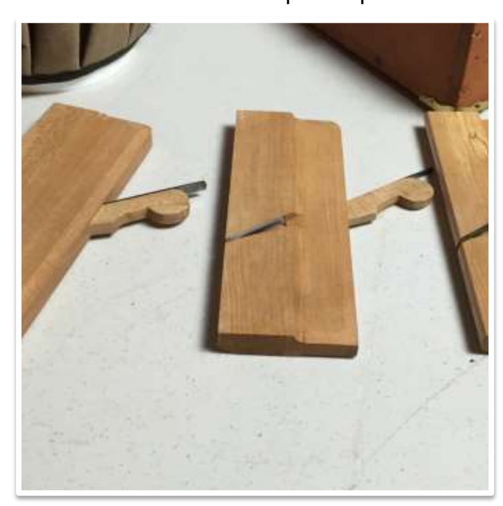
Norm Smith's handmade profile planes