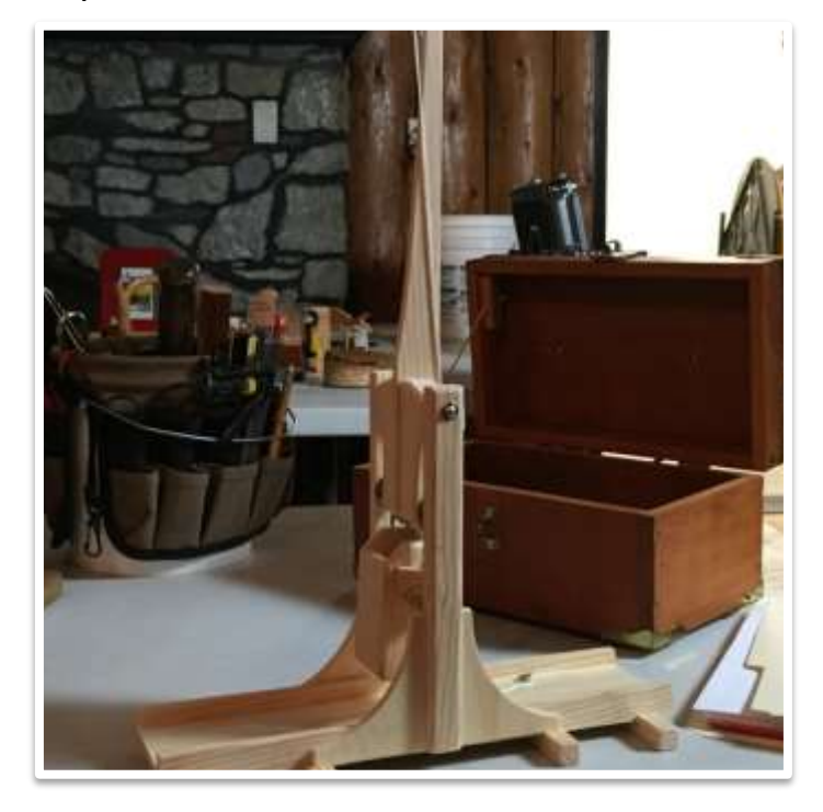
Toy of the Month - Trebuchet