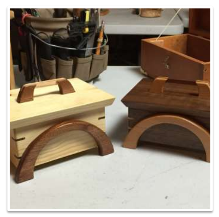
Gary Weyer's new creations