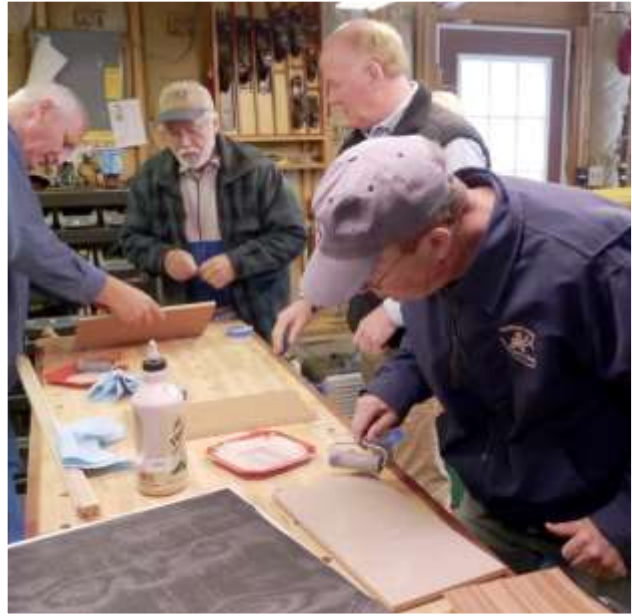
Learning new skills!