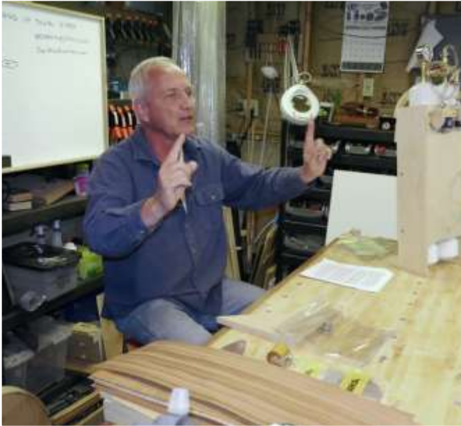
Optometrist or Vacuum Veneer Genius?