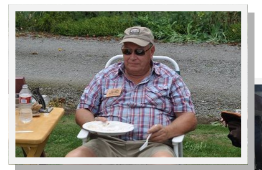
More picnic fun.