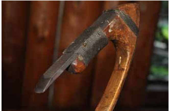
Adz made from an old file

He likes window shutters and uses them as sides for a chest, for example, or as chair-backs. An unassuming man with a storyteller's charm, Eicker brought his tools and a lot of recycled items to illustrate what can be done with unlikely materials.