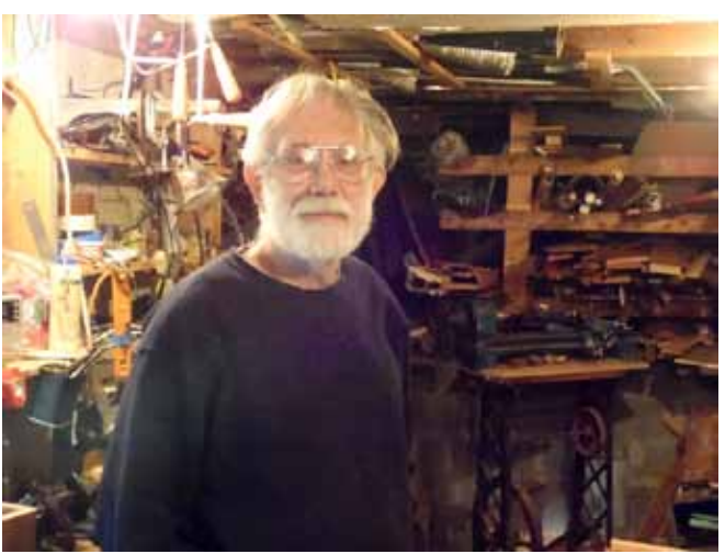
MEET THE NEW MEMBER

no longer has the boat, but enjoys woodworking in his shop just north of Ferndale. Some of his favorite projects include musical instruments; he's made several harps, a hammer dulcimer, and something I can't even pronounce right, a psaltery! He recently completed a set of dinning room chairs for his daughter, and is working on a hurdy gurdy. This link will take you to a video of a hurdy gurdy being played. http://www.youtube.com/watch?v=xLIIbMA6VFA