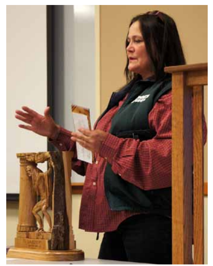
One of the projects on display at Wood-