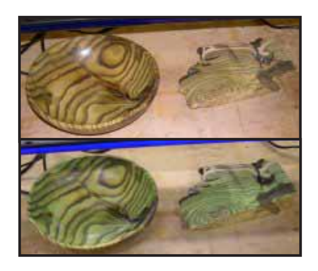
Alesson in fluorescense by Dave Blair. Bottom photo is shown under a black light.