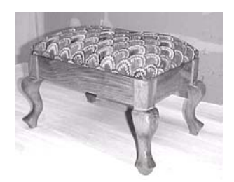
Cabriole leg foot stool by Lyle hand