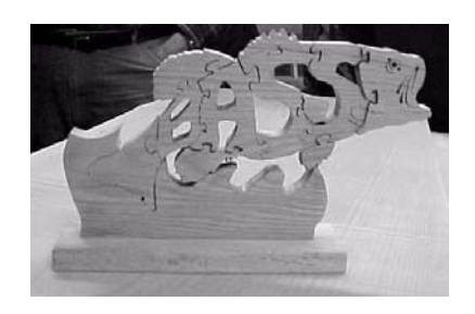
Scroll saw Puzzle by guest Curt Crape

From I-5 take exit 236, turn east on Bow Hill Rd. which becomes Prairie Rd. Jim's shop is about six miles from I-5 on Prairie Rd.