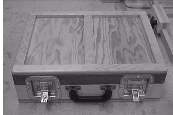
Jay Giessel's wooden Briefcase and heavy duty clasp

Don't Forget "Bring and Brag." We all do something unique or have something that others would like to see