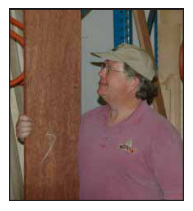
Have you hugged your board today??? You will if it's $16/bd. ft. figured Bubinga!

Edensaw has it all! From plywood to an entire Bubinga tree.....just waiting for your next project.