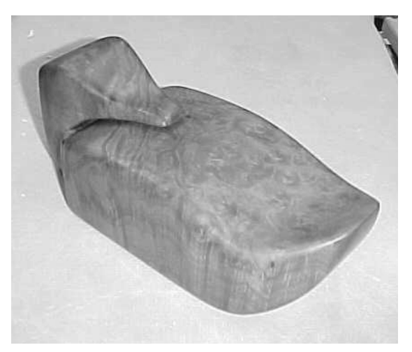
The finished product!