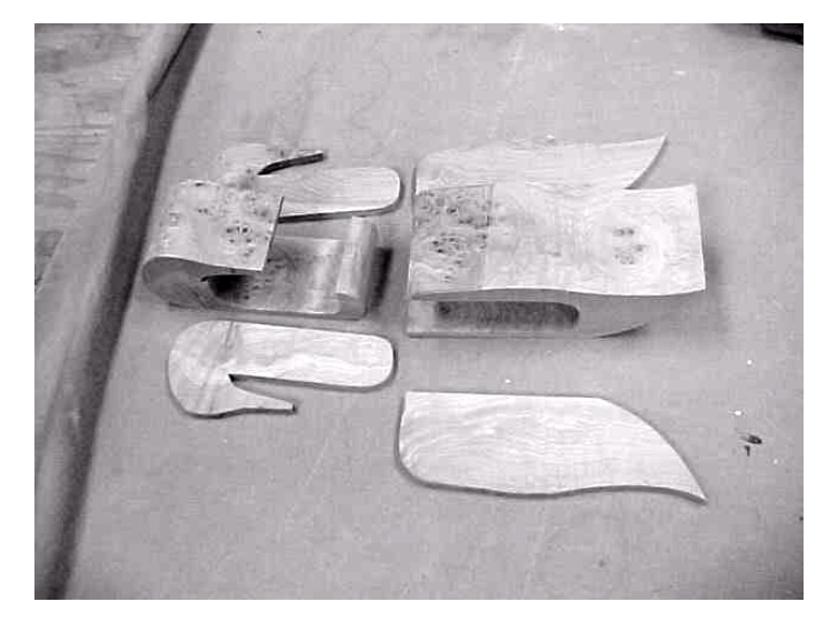
Pieces after the band saw.