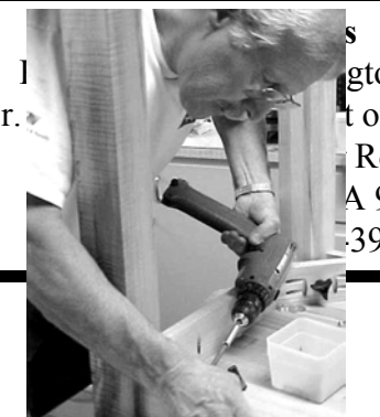
gton l t only Rd. A 982