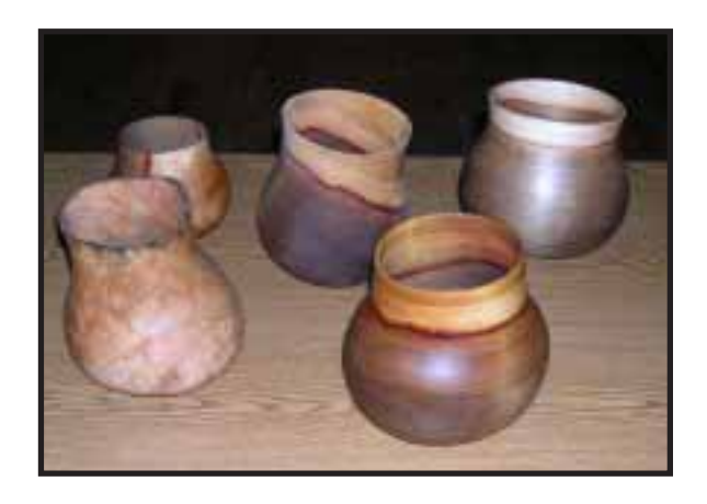
Bob Doop's ensemble of turned madrone baskets.