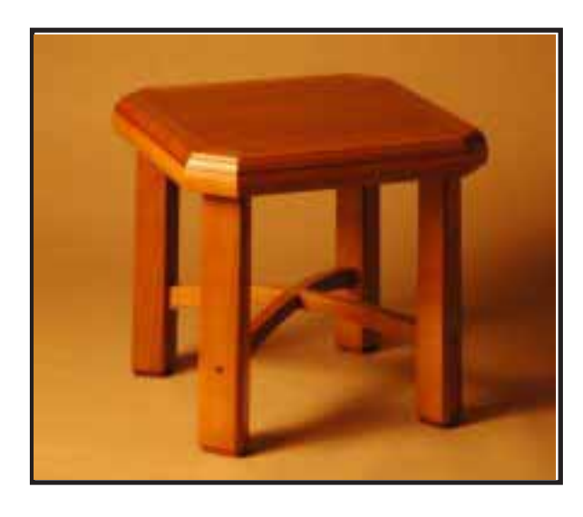
An exquisite apple wood table by Gary Holloman