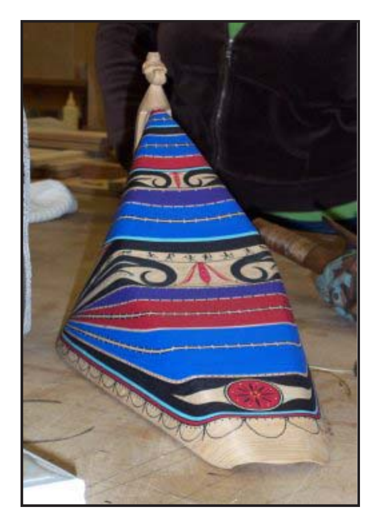
Ceremonial Hat made from a single piece of wood