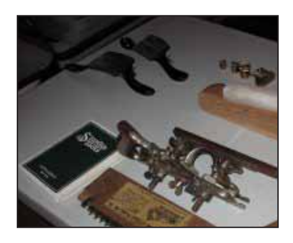
A small sample of Dave's collection

methodology, and Blair did an excellent job exhibiting and explaining the virtues of about four dozen wood planes, some quite rare, but all sharp and in good working condition.