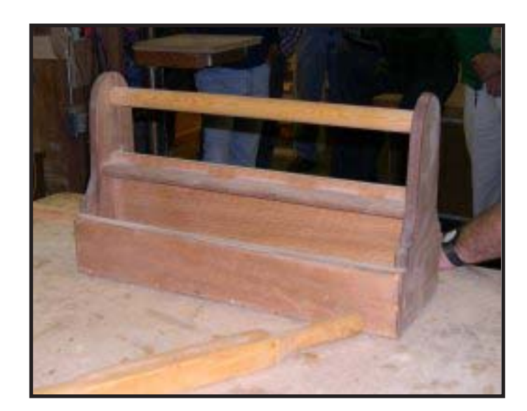
First projects built by all students at Home Port; a tool tote which they will use during their time at the school and then an oar built by traditional method.

study academic subjects which result in transferable high school credits. The students also can opt to earn their GED while at Home Port.