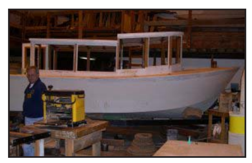
Home Port's latest boatbuilding project.....an Alaskan Skiff which will be used for student field trips and other learning experiences. The school is currently looking for funding of the purchase of an outboard motor to power the boat.

The long boat, named the Plume, is kept at Squalicum Harbor in Bellingham and is used as a means of teaching both seamanship and teamwork....it definitely takes teamwork to get 10 oars all pulling in the same direction at the same moment! The Plume is also rigged for sailing and again it takes a great deal of teamwork successfully sail the boat with it's traditional rig.